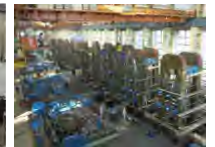
装配车间 Assembly Shop