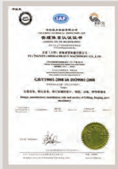
ISO9001 国际标准质量管理体系认证 ISO9001 Certification