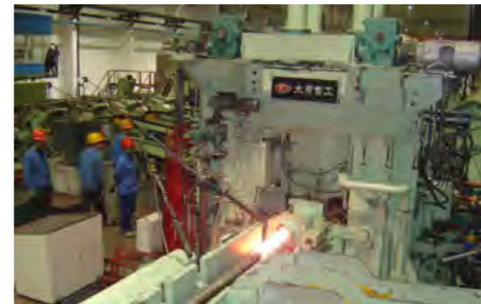
Φ159mm穿孔机 Φ159mm Piercing Mill