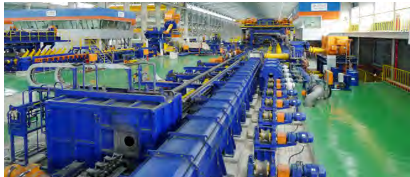
Φ180mm 三辊连轧管机组 Φ180mm Three-Roll Type Continuous Rolling Tube Mill