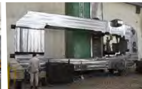
Φ260mm 落地镗铣床 Φ260mm Boring and Milling Machine