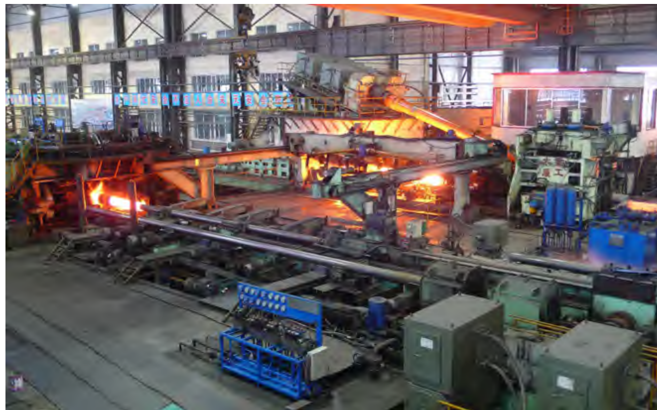
Φ273mm Accu-Roll管轧机组 Φ273mm Accu-Roll Tube Mill