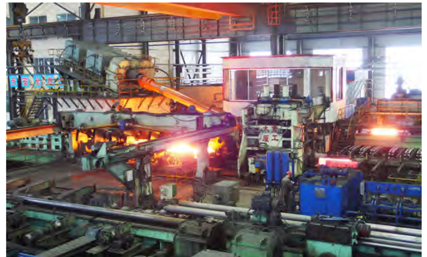
Φ273mm穿孔机 Φ273mm Piercing Mill