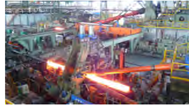
Φ325mm ASSEL管轧机组 Φ325mm Assel Tube Mill