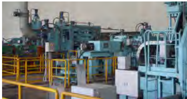
酸洗机组 Pickling Line