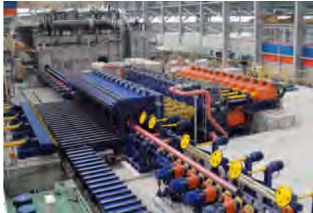
Φ180mm机组24机架张减机 Φ180mm 24-Stand Stretch Reducing Mill