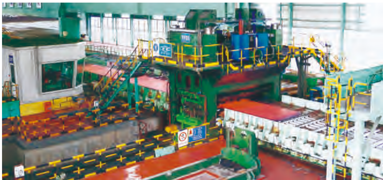
5米热矫正机 5m Hot Leveler

我公司是国内最大的矫正机专业化设计制造基地，“TZ”牌板材矫正机已有40余年的历史，广泛应用于冶金、装备制造、有色金属等领域，矫正机从5辊到23辊，矫平厚度从0.5-100mm,已形成系列产品。我公司自主研发的7辊、9辊、11辊全液压矫正机矫平厚度可到100mm，矫平宽度可达5000mm。“大型宽厚板矫正机成套技术装备开发与应用”荣获国家科学技术进步奖；“9辊矫正机”荣获国家科学技术进步三等奖；“5辊中厚板与宽厚板预矫正机”和“7辊带钢全液压矫正机”获得实用新型和发明专利。