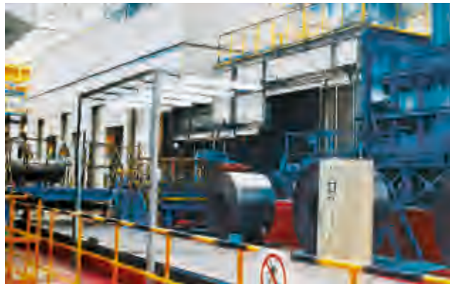
板带冷轧 Cold Rolling Mill