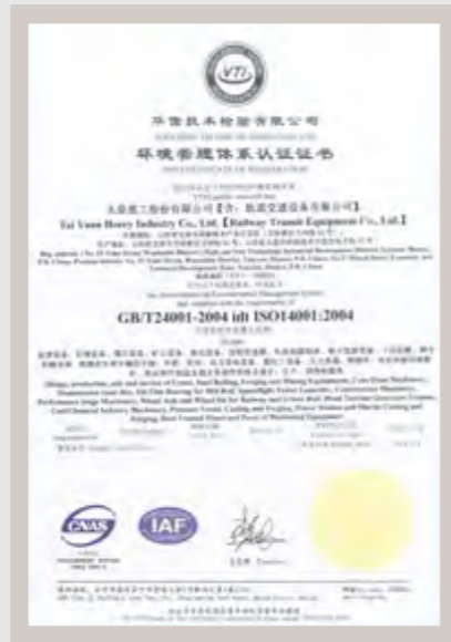
环境管理体系认证证书 Authentication Certificate of Environment Management System