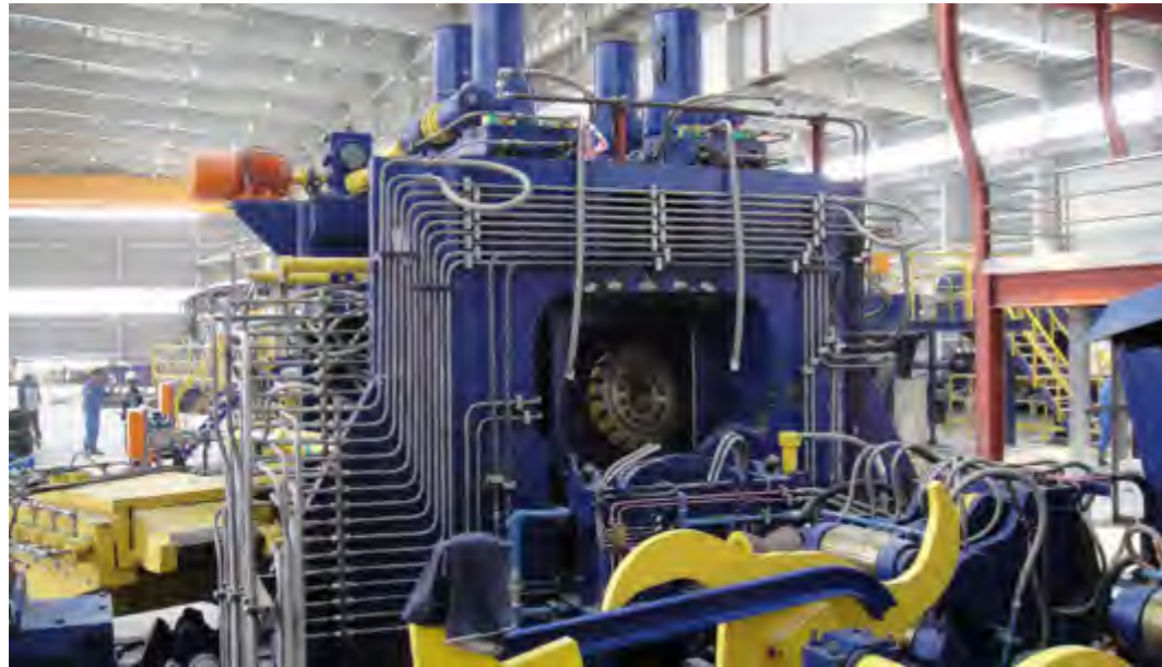
Φ180mm穿孔机 Φ180mm Piercing Mill