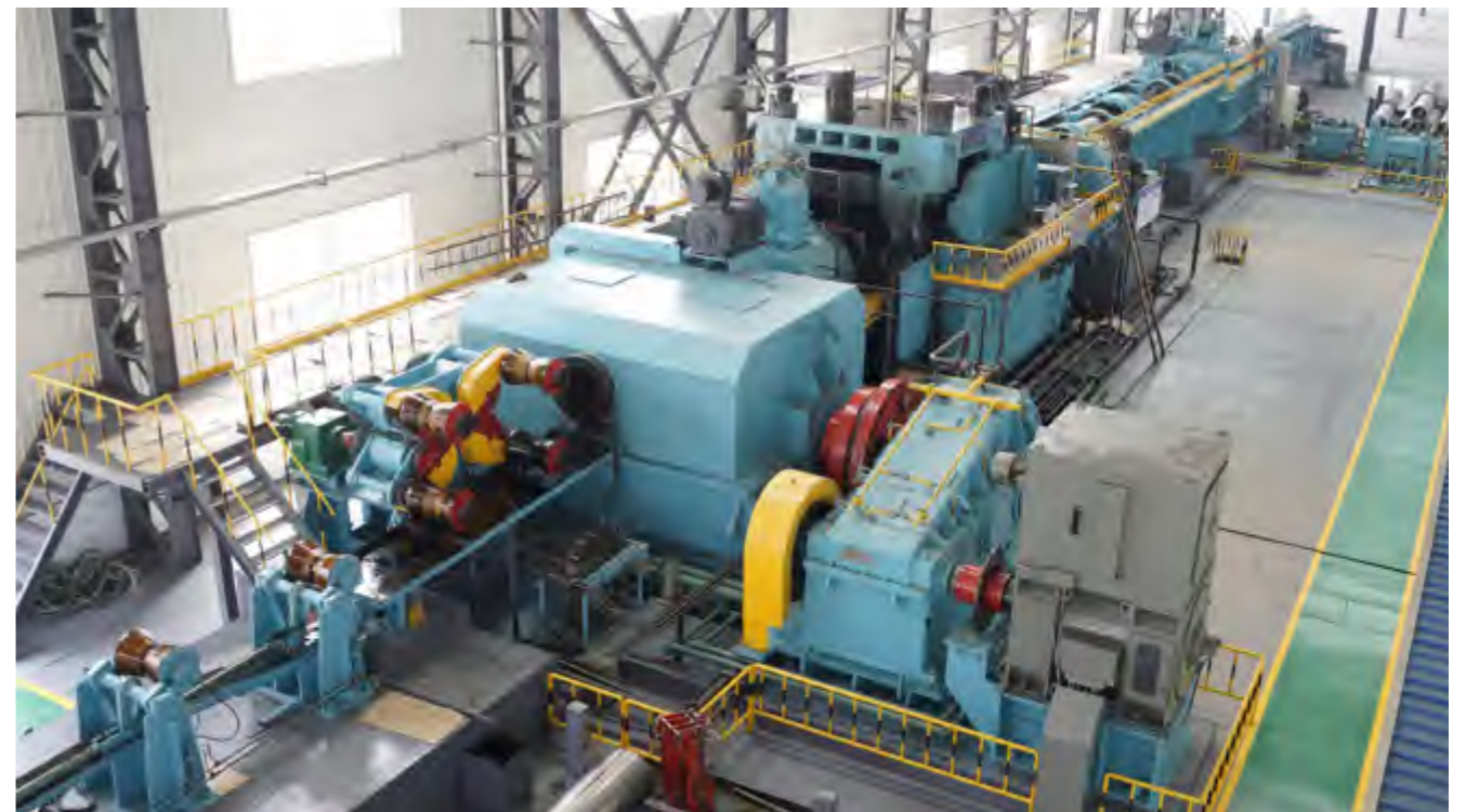
Φ720mm 皮尔格冷轧机组 Φ720mm Pilger Cold Pipe Rolling Mill