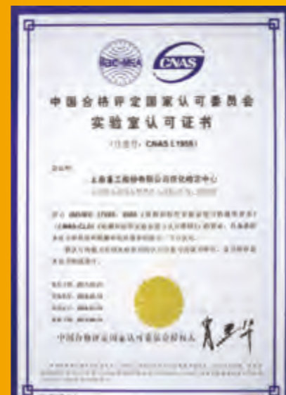
国家实验室认可证书 National Laboratory Accreditation Certificate