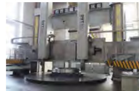
8.5米立车 8.5m Vertical Lathe