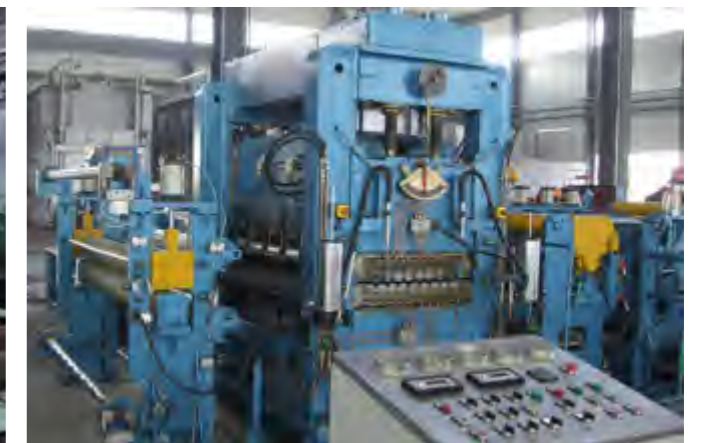
17辊冷轧薄板矫正机 17-Roll Cold-Rolling Strip Leveler