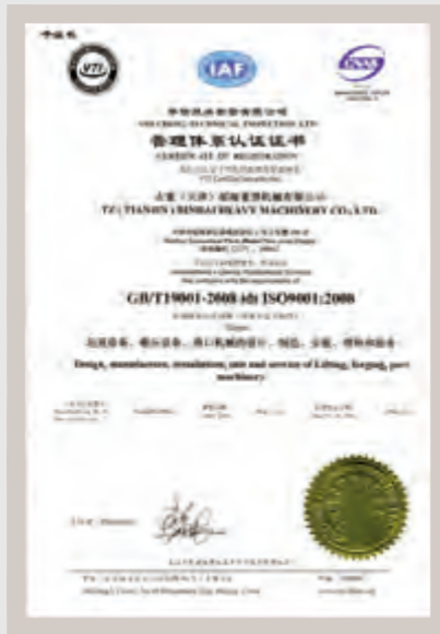
ISO9001 国际标准质量管理体系认证 ISO9001 Certification