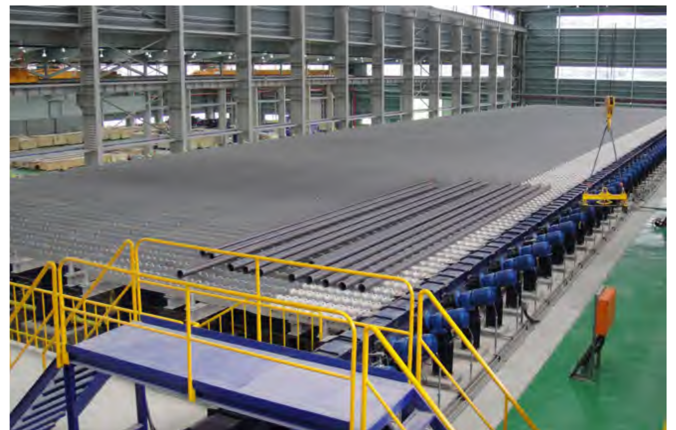
冷床 Cooling Bed