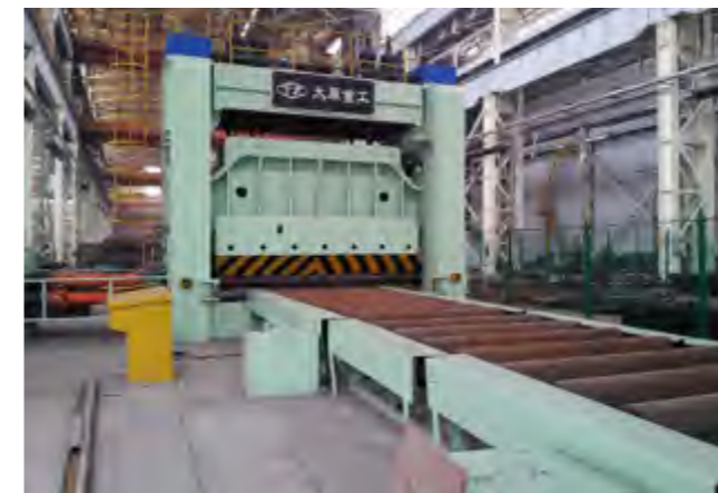
高强度矫正机 High Strength Leveler