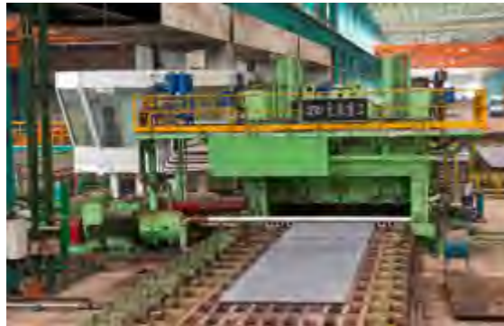
4.3米热处理矫正机 4.3m Hot Treatment Leveler