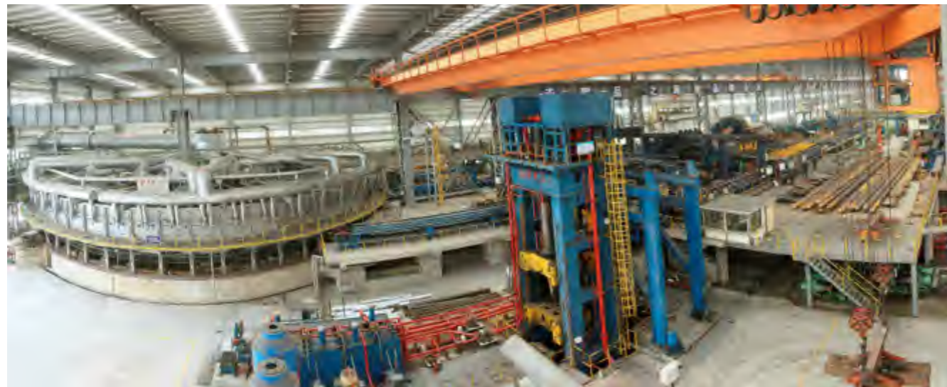
Φ720mm 大口径无缝管生产线 Φ720mm Large Diameter Seamless Pipe Production Line

In China, TYHI is the supplier of seamless tube mills with the strongest capability of research and development and manufacturing, having the most complete varieties of products. The scope of its supply covers the entire seamless tube production line, including billet preparation area, rotary hearth furnace area, piercing mill area, elongation mill area, stretch reducing mill/sizing mill area, cooling bed area, finishing area, heat treatment area and transport facilities between various mills. Currently its products not only account for the market share of 70% in China but also are exported to many overseas countries like South Korea, India, Saudi Arab, Indonesia etc.