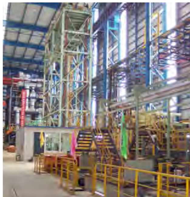
热镀锌机组 Hot Dip galvanizing

Through import advanced technology, Steel Rolling Sub-company of TYHI has manufactured and supplied more than 50 lines of strip rolling for domestic and foreign customers. We have designed and supplied continuous pickling lines, carbon steel, stainless steel and silicon steel cold continuous rolling line, skin-pass mills, galvanizing line, color coating line, turn-over coil line, wrapping line and chain conveyer.