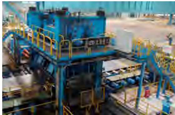
5米温矫正机 5m Warm Leveler