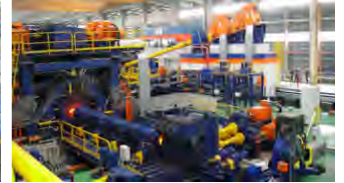
Φ180mm连轧管机组 Φ180mm Continuous Rolling Tube Mill