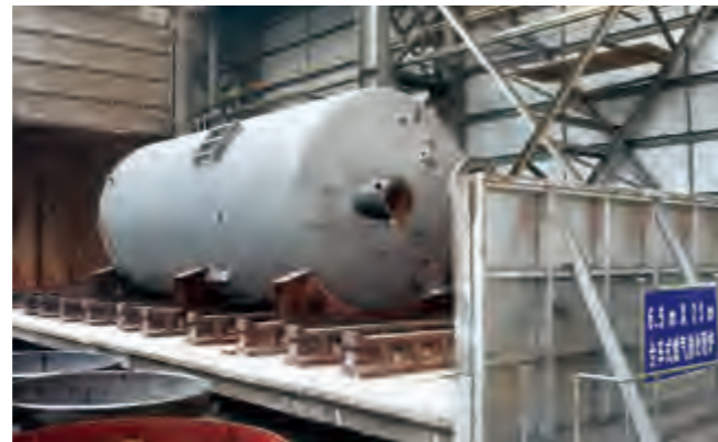
80t钢包精炼炉 80t Refinery Furnace