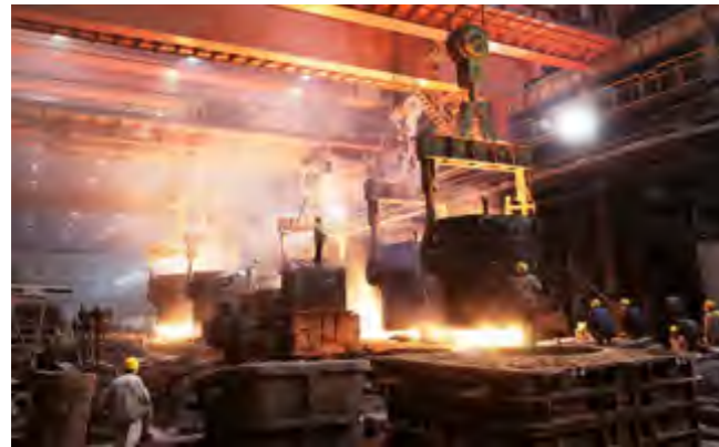
6.5x25m热处理炉 6.5x25m Heat Treatment Furnace

太原重工各类设备拥有量达4400余台，其中主要生产设备1700余台，重点设备200余台，进口设备260余台套。其中120t、80t钢包精炼炉，6.4m x 25000m热处理炉，可为用户提供单件重量500t以下的各类铸件；12500t锻造压机、4500t水压机、1250t水压机，可为用户提供1500 x 14000mm重量在260t的各类锻件；装配车间具有375t的起重能力。