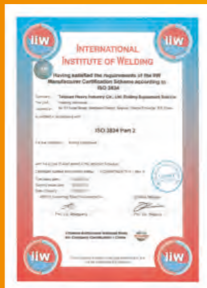
国际焊接证书 International Welding Certificate