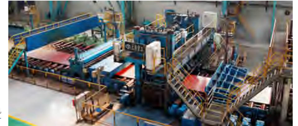
5米预矫正机 5m Pre-leveler

TYHI is the largest manufacturer of plate levelers in China, which has engaged in the design and manufacture of the levelers for more than four decades, with our own brand “TZ”. It's applied to the metallurgical area, equipment manufacturing and nonferrous metal etc. The levelers have become a series of products from 5 to 23 rolls with the leveling thickness of 0.5 to 100mm. The 7-roll, 9-roll and 11-roll fully hydraulic leveler designed by TYHI is capable of producing the plates of 100mm thick and 5000mm wide. The heavy-duty wide and thick plate leveler has been awarded the National Prize for Scientific and Technological Progress. 9-roll levelers have been awarded the Third Prize of National Scientific and Technological Progress. 5-roll pre-levelers for middle thick plate, wide and thick plate and 7-roll fully hydraulic strip levelers have been awarded the patent for utility models and invention.