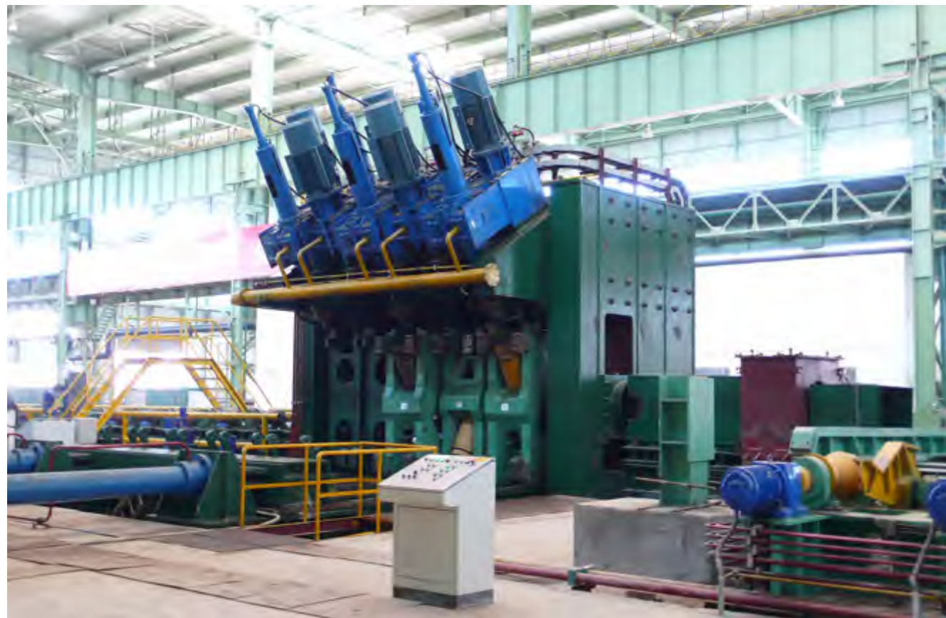
Φ1200mm3机架定径机 Φ1200mm 3-Stand Sizing Mill