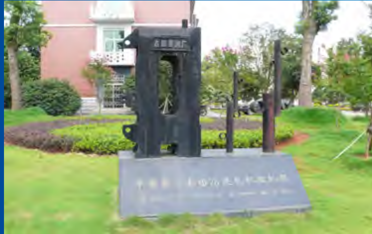
中国第一套Φ76mm连轧机架 The Stand Of The First Set Of Φ76mm Rolling Mill In China