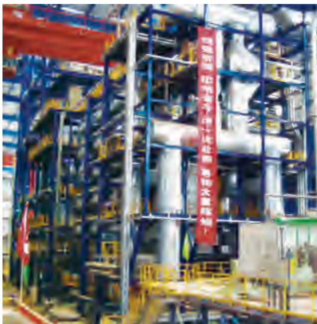
退火机组 Annealing Line

我公司为国内外厂家设计制造了五十余条不同基数水平的板带深加工生产线，设计制造了连续式酸洗机组，碳钢、不锈钢、硅钢冷连轧机组，平整机组、镀锌机组、彩涂机组、翻卷机组、打包机组及运输链等冷轧成套机组。