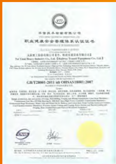
职业健康安全管理体系认证 International Standards Certification of Vocational Health and Safety Management System