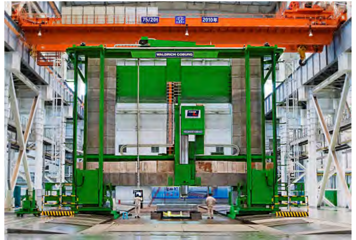
数控天桥铣机群 CNC Machining Centers