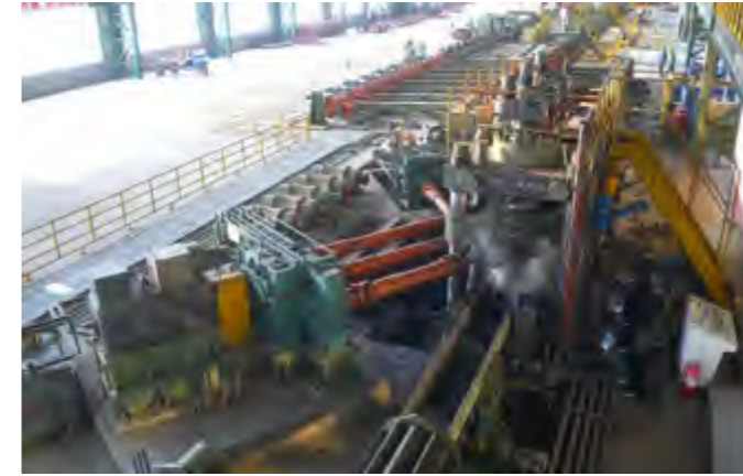
Φ325mm管材矫正机 Φ325mm Straightening Machine