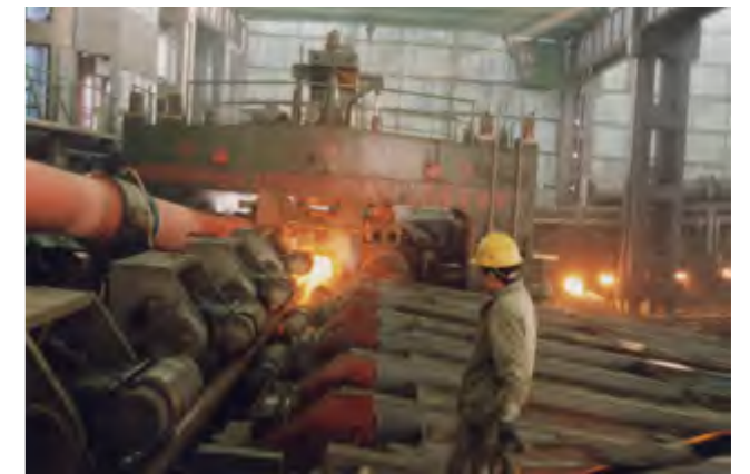
Φ2000mm巨龙穿孔机 Φ2000mm Large Diameter Piercing Mill