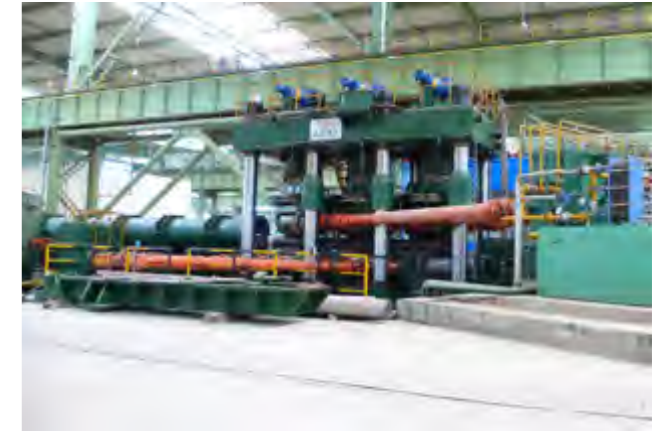
Φ720mm管材矫正机 Φ720mm Straightening Machine