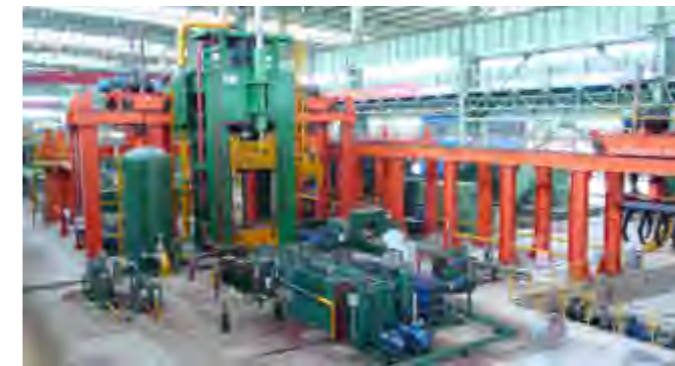
20MN压力穿孔机 20MN Piercing Press