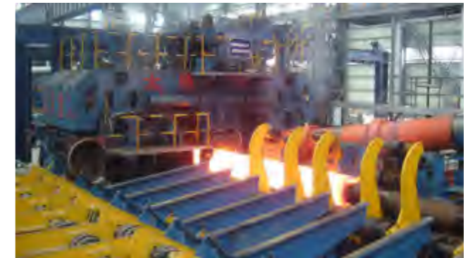
Φ720mm穿孔机 Φ720mm Piercing Mill