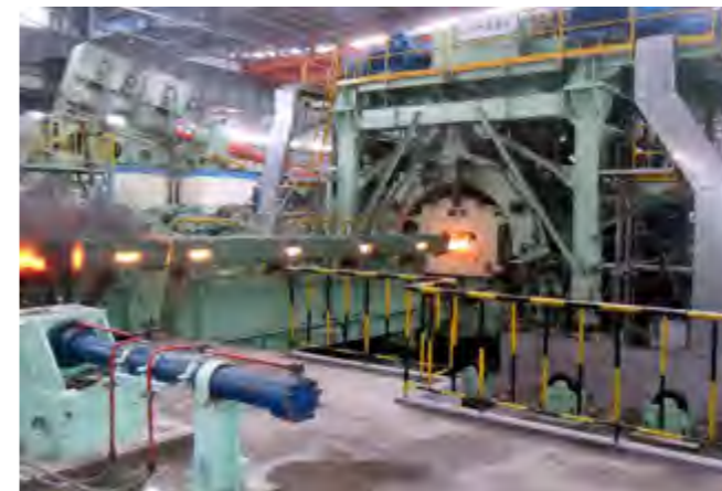
Φ180mm连轧管机组 Φ180mm Continuous Rolling Tube Mill