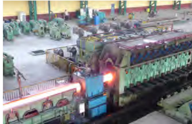
Φ273mm机组12机架定径机 Φ273mm 12-Stand Sizing Mill