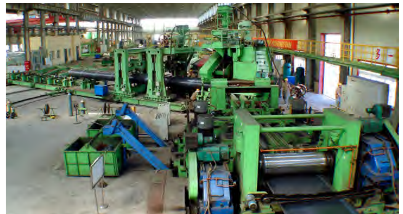
螺旋焊管生产线 Welded Pipe Production Line