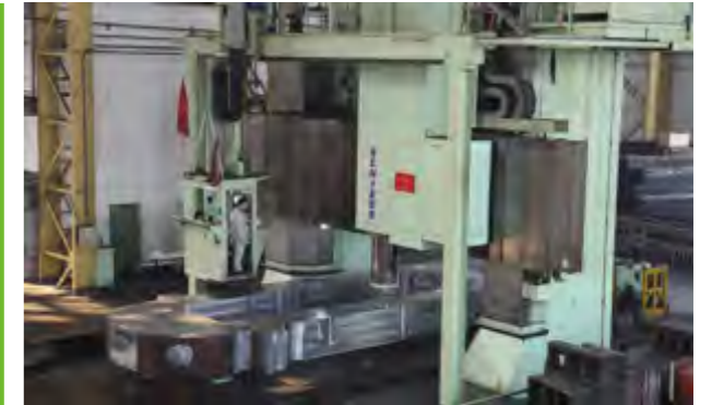
4x15m龙门铣 4x15m Gantry Milling machine

TYHI has over 4400 sets of various facilities in total, among which the main production equipment is over 1700 sets, the high-accuracy and heavy duty equipment 200 sets, the imported equipment 260 sets. They include 120t and 80t ladle refinery furnace, 6.4m X 25m heat treatment furnace for producing the castings weighing Max.500t, 125MN, 45MN and 12.5MN hydraulic forging presses for producing the 1.5m x 14m forgings weighing Max. 260t. Moreover, in the assembly shop, the lifting capacity of 375t is available.