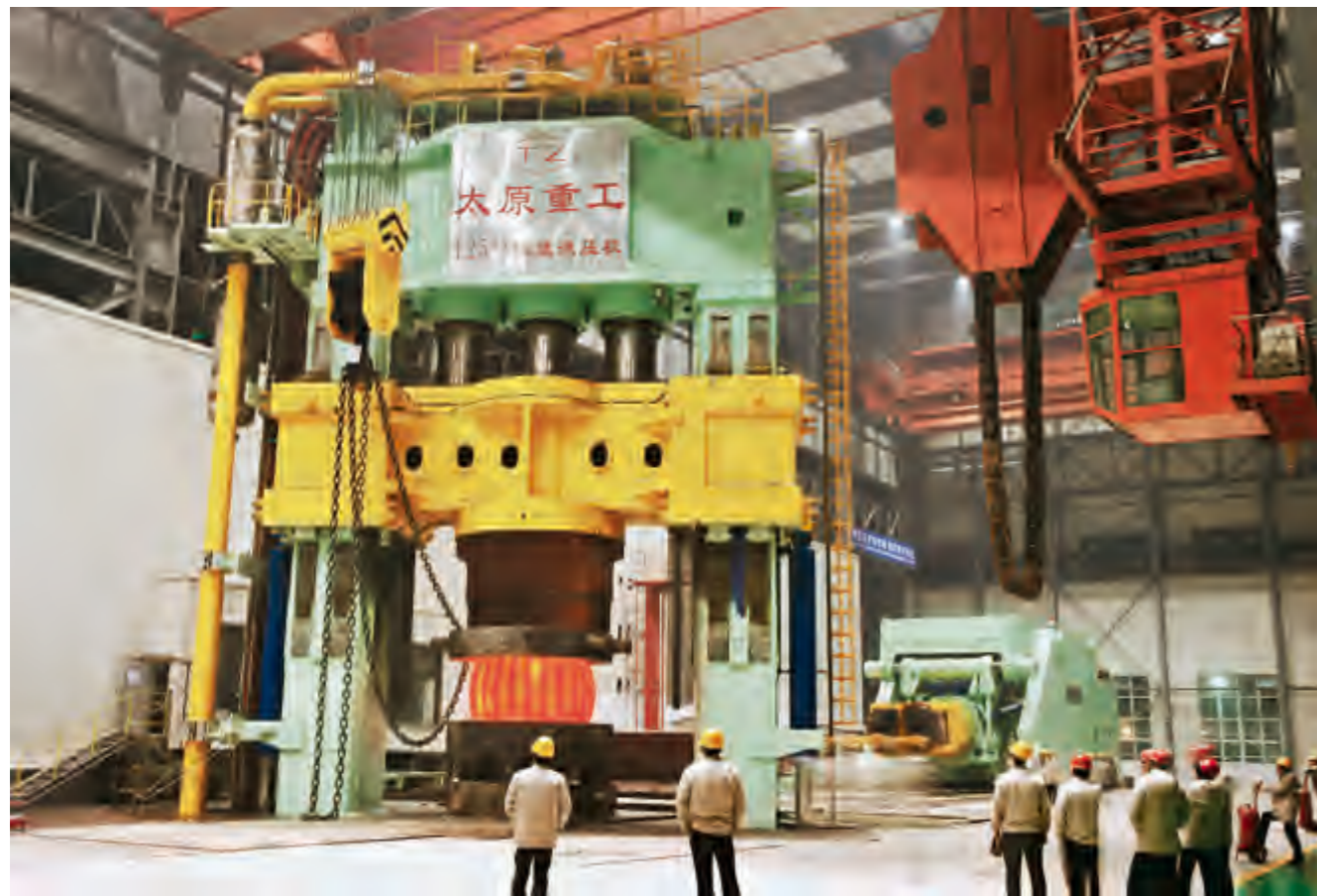
125MN液压锻造机 125MN Open Die Hydraulic Forging Press

TYHI has over 4400 sets of various facilities in total, among which the main production equipment is over 1700 sets, the high-accuracy and heavy duty equipment 200 sets, the imported equipment 260 sets. They include 120t and 80t ladle refinery furnace, 6.4m X 25m heat treatment furnace for producing the castings weighing Max.500t, 125MN, 45MN and 12.5MN hydraulic forging presses for producing the 1.5m x 14m forgings weighing Max. 260t. Moreover, in the assembly shop, the lifting capacity of 375t is available.