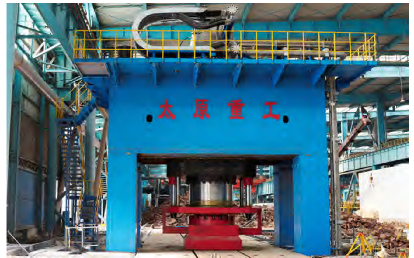
60MN压平机 60MN Flattening Machine