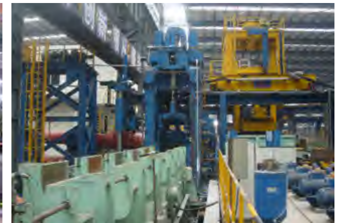
Φ720mm皮尔格热轧管机组 Φ720mm Hot Pilger Mill